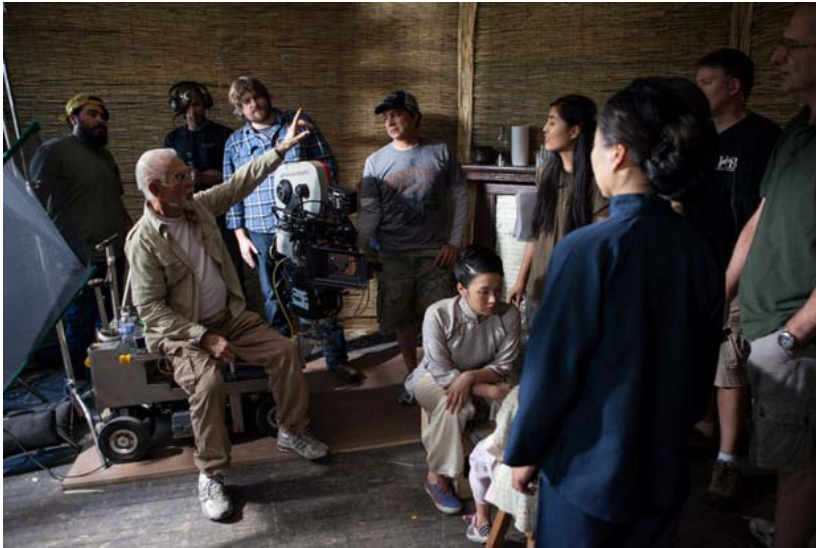
The cast and crew on set