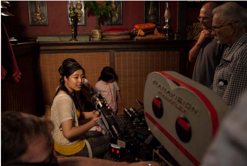
Setting up a scene